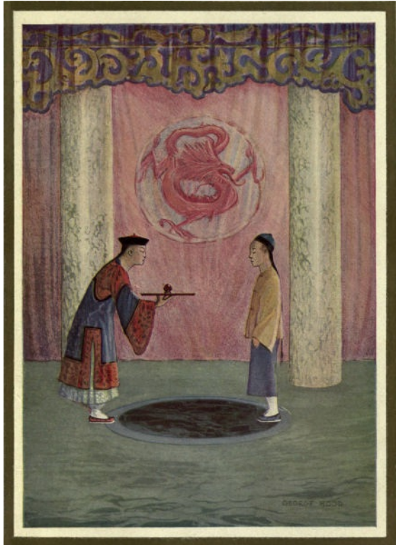
“TSIAN TANG BROUGHT OUT A PLATTER OF RED AMBER ON